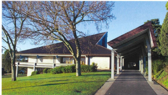
All Saints' Anglican Church, Howick, Auckland

Since 2000, the name Thursdays @ Seven has become a byword for music listeners in east Auckland. Audiences can roll up at the beautiful contemporary-style All Saints' Anglican Church in Selwyn Road, central Howick, and expect to bliss out for an hour or more of music presented by excellent performers. The crystal clear acoustic of the church is ideal for intimate chamber music. Best of all, the series is taking music to people where they are, near home – no parking hassles, no high costs, no extra travel time.