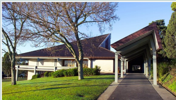
Built in 1970, the All Saints' Church