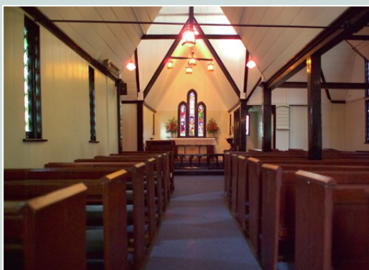
Dating back to 1847, the Selwyn Church seats